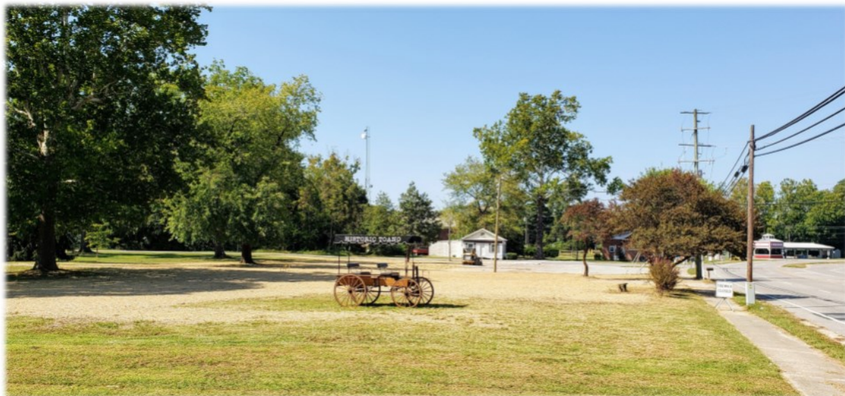
Our new Toano Station Grounds. She cleaned up pretty nice, didn't she?