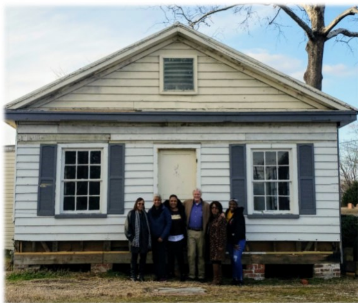
Historic Travers Home

The Travers home will have its next life as The Virginia Bread Company, a bakery, coffee, and sandwich shop. The new store will keep the features that make this building special. For example, the old hardwood floor boards were 6” wide in the original 1900 home and 4” wide in the 1949 addition. Both eras will be preserved in the restoration of the house. In addition, artifacts found in and around the building will be displayed in the bakery. Watch for more details on this new business coming to town.