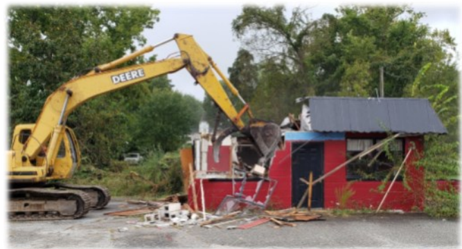
Removing nonconforming buildings and preparing for Toano Station.