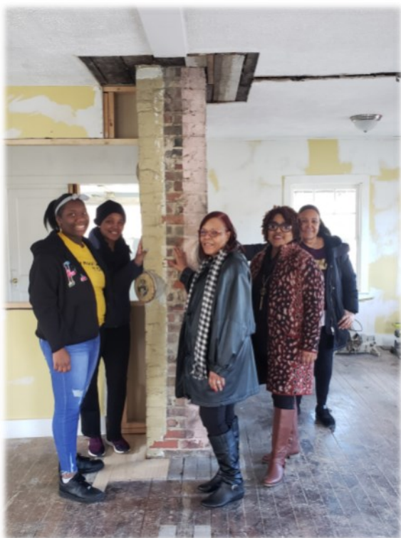
Travers family members visit the former family home